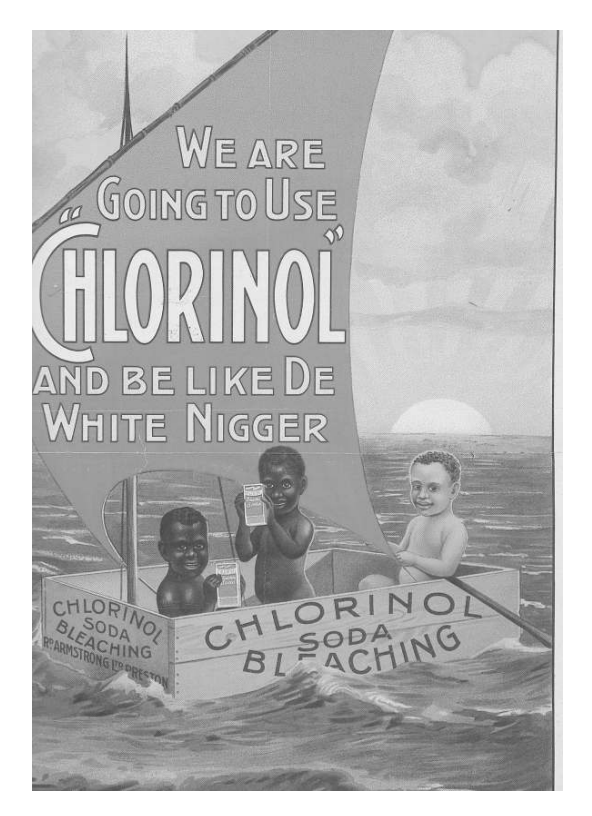
Adverts did not hesitate to use racism: an advert from 1907

Uncle Mack's Minstrels still played at the seaside in Brighton in the 1930s.