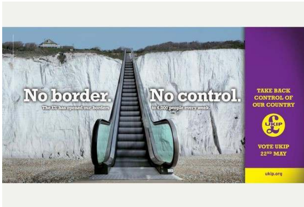
Figure 3b UKIP 2015 General Election Posters